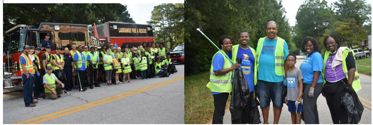
Roughly sixty people participated in the city's August litter cleanup

LaGrange, Ga. August 24, 2019 – The City of LaGrange held its monthly litter cleanup at Berta Weathersbee Elementary School today. Roughly sixty community members, city leaders as well as city employees participated in the event.