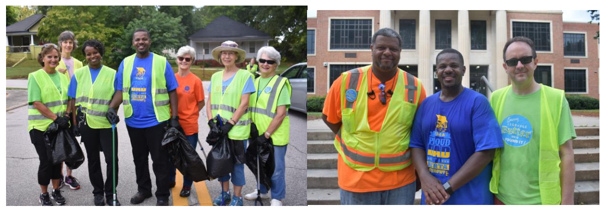
Community members participated in the city's litter cleanup

For next month's litter pickup, the city will partner with Berta Weathersbee Elementary. The event will be Saturday, August 24<sup>th</sup> from 8-10 a.m. at Berta Weathersbee Elementary School, 1200 Forrest Avenue.