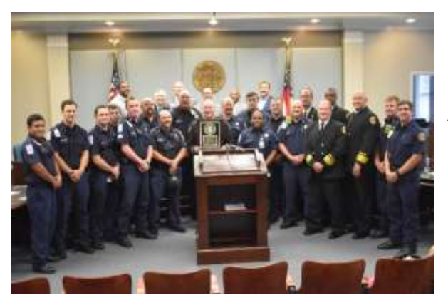
The LaGrange Fire Department was honored at City Council Tuesday evening

LaGrange , Ga. August 16 , 2018 – The LaGrange Fire Department was honored Tuesday night by the LaGrange Mayor and City Council Tuesday night.