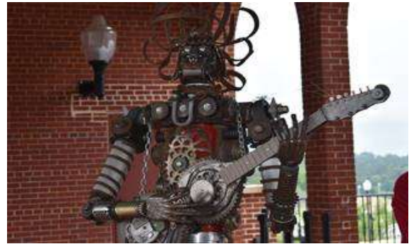
Chuck Moore metal sculptures

The artwork is on permanent loan to the City of LaGrange.